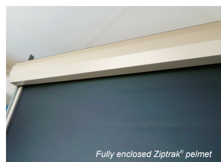
Fully enclosed Ziptrak® pelmet