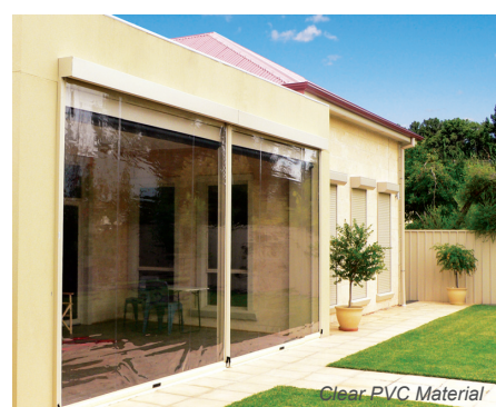
Clear PVC Material