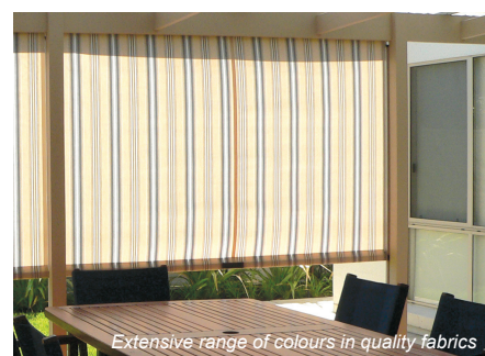
Extensive range of colours in quality fabrics

Discover a simpler way to shade and protect your outdoor way of life.