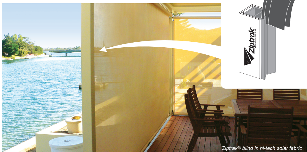
Ziptrak® blind in hi-tech solar fabric